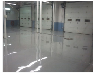
CSI Division 9: Finishes - Flooring